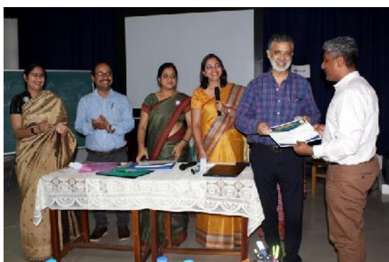
VALEDICTORY FUNCTION- RBCW 2021