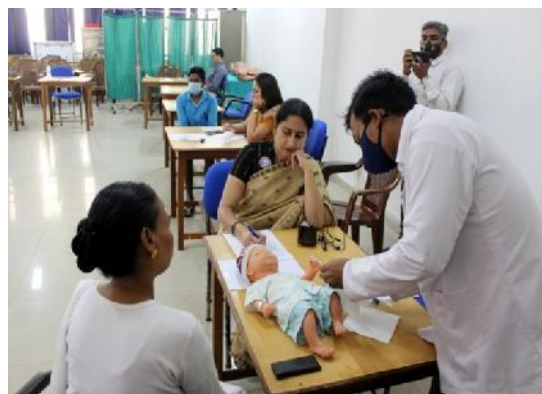
OSCE WORKSHOP DEMONSTRATION- RBCW 2021